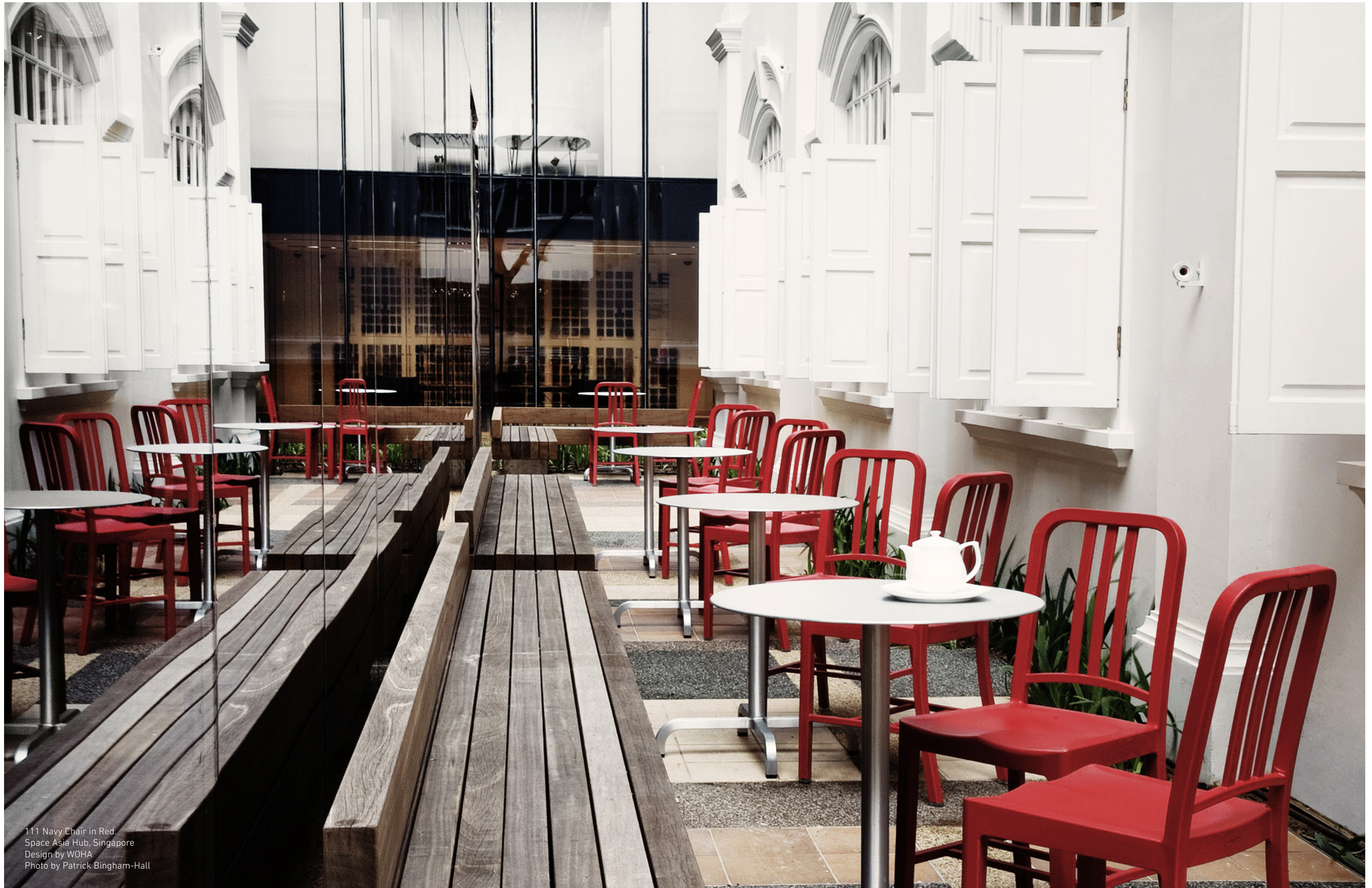
111 Navy Chair in Red. Space Asia Hub, Singapore Design by WOHA