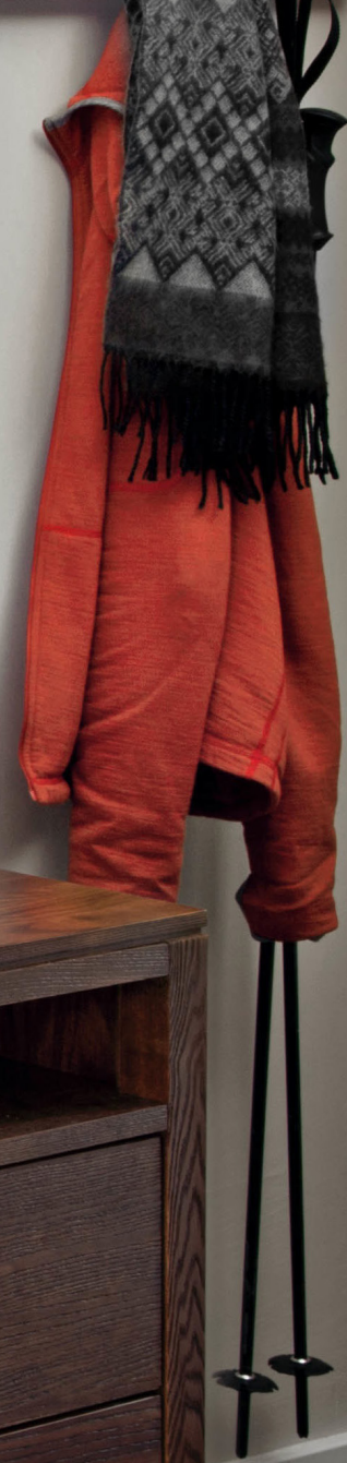
111 Navy Chair in Persimmon. Basecamp Hotel, South Lake Tahoe, USA Design by Elaine Cotter