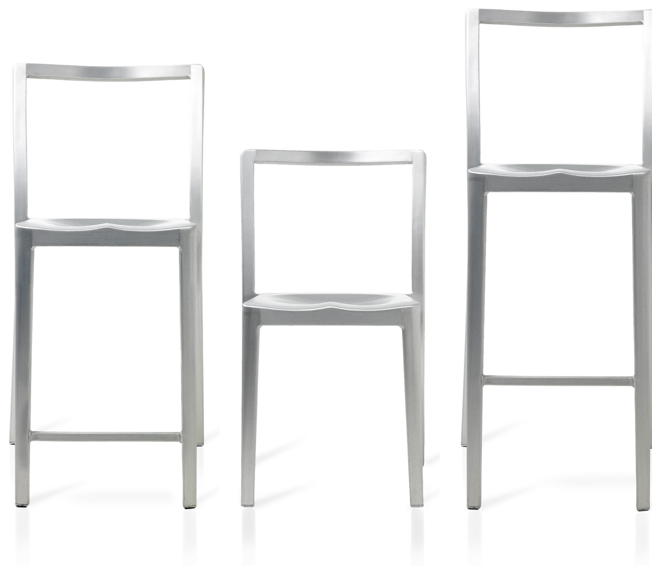
Left to right: Icon Counter stool, Icon Stacking chair, Icon Barstool, Opposite page: Icon Stacking chair.

Icon is a stacking chair cousin to the famous Starck-designed Hudson chair. It has been used in hotels, bars and restaurants worldwide, as well as training centers, meeting areas and schools. Starck describes Icon as "the chair I see when I close my eyes." You can expect your Icon chair to last 150 years or longer.