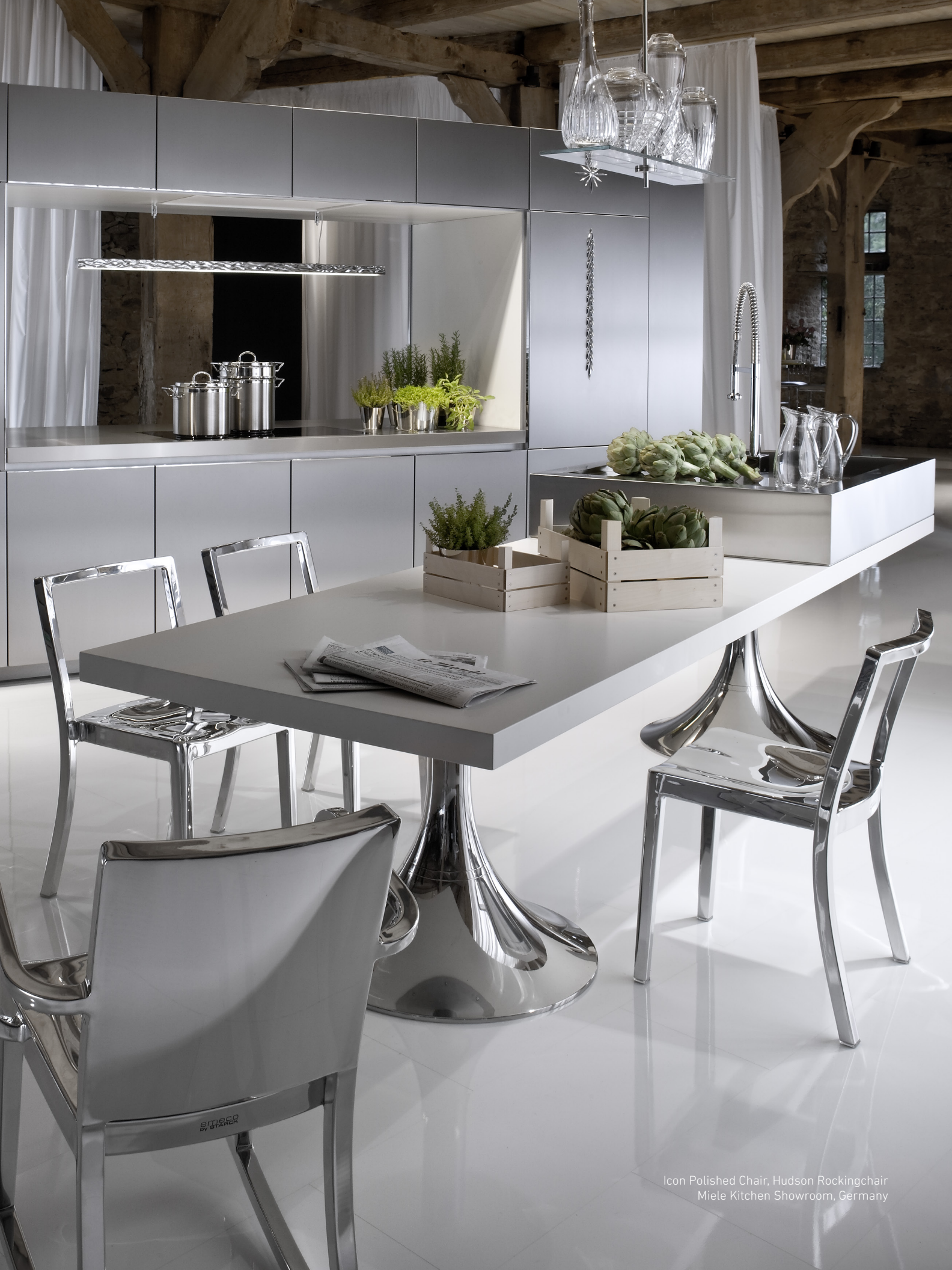
Icon Polished Chair, Hudson Rockingchair Miele Kitchen Showroom, Germany