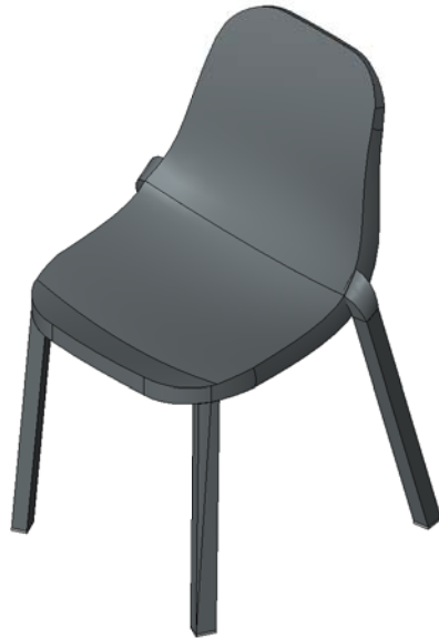
④ 3D View