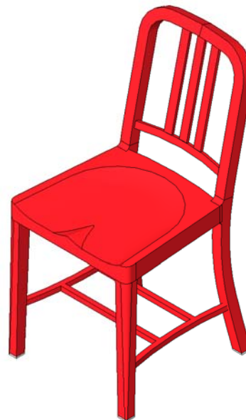
④ 3D View