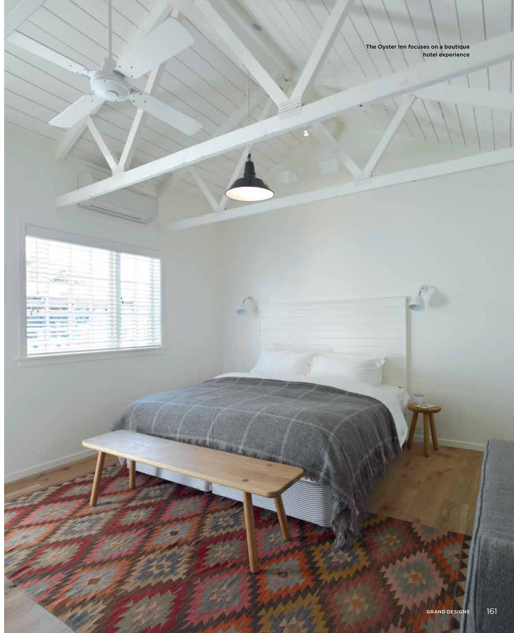
The Oyster Inn focuses on a boutique hotel experience