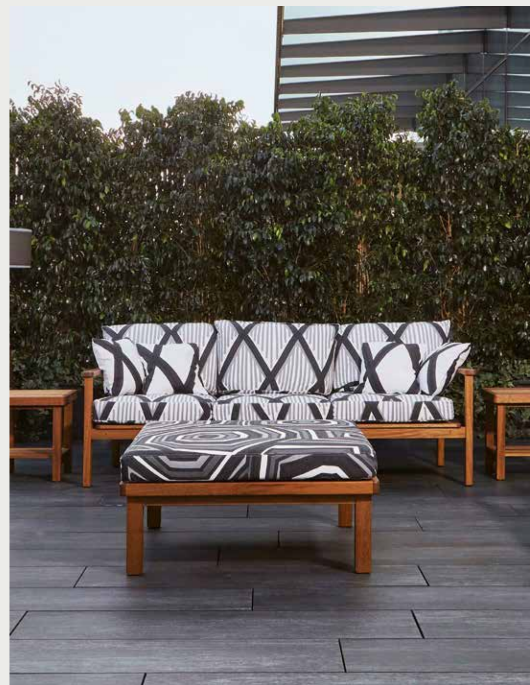
Capri design—Matteo Thun