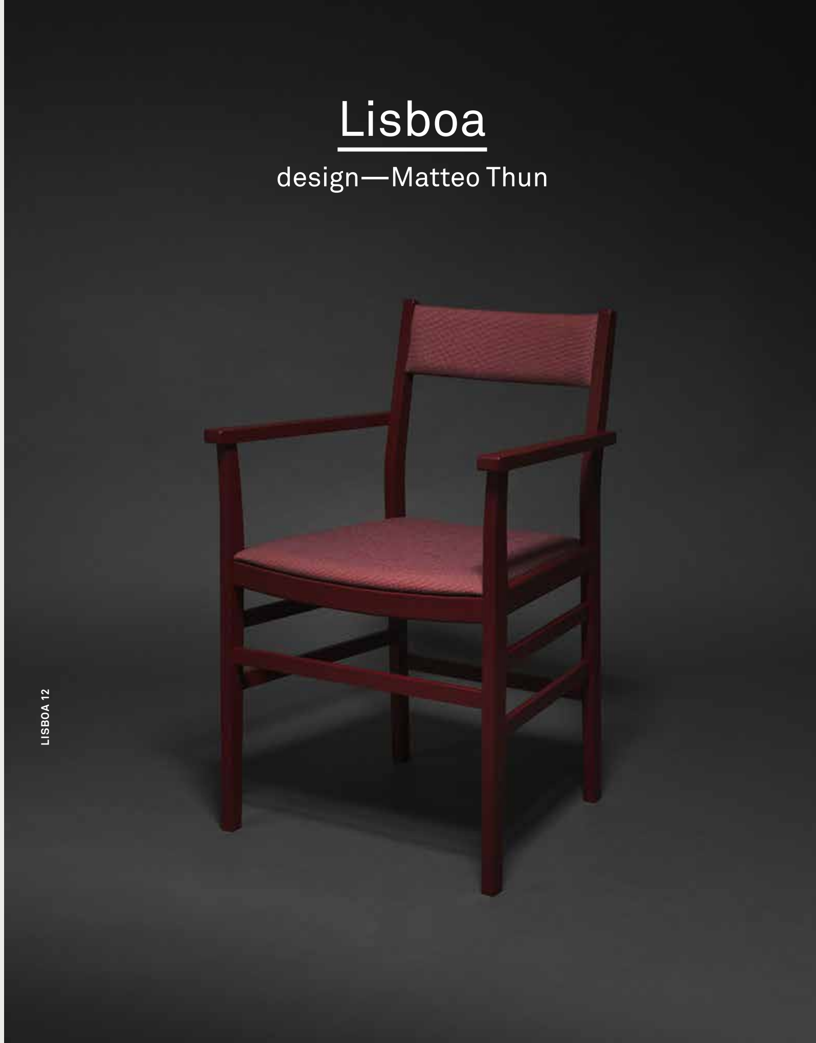
Lisboa design—Matteo Thun