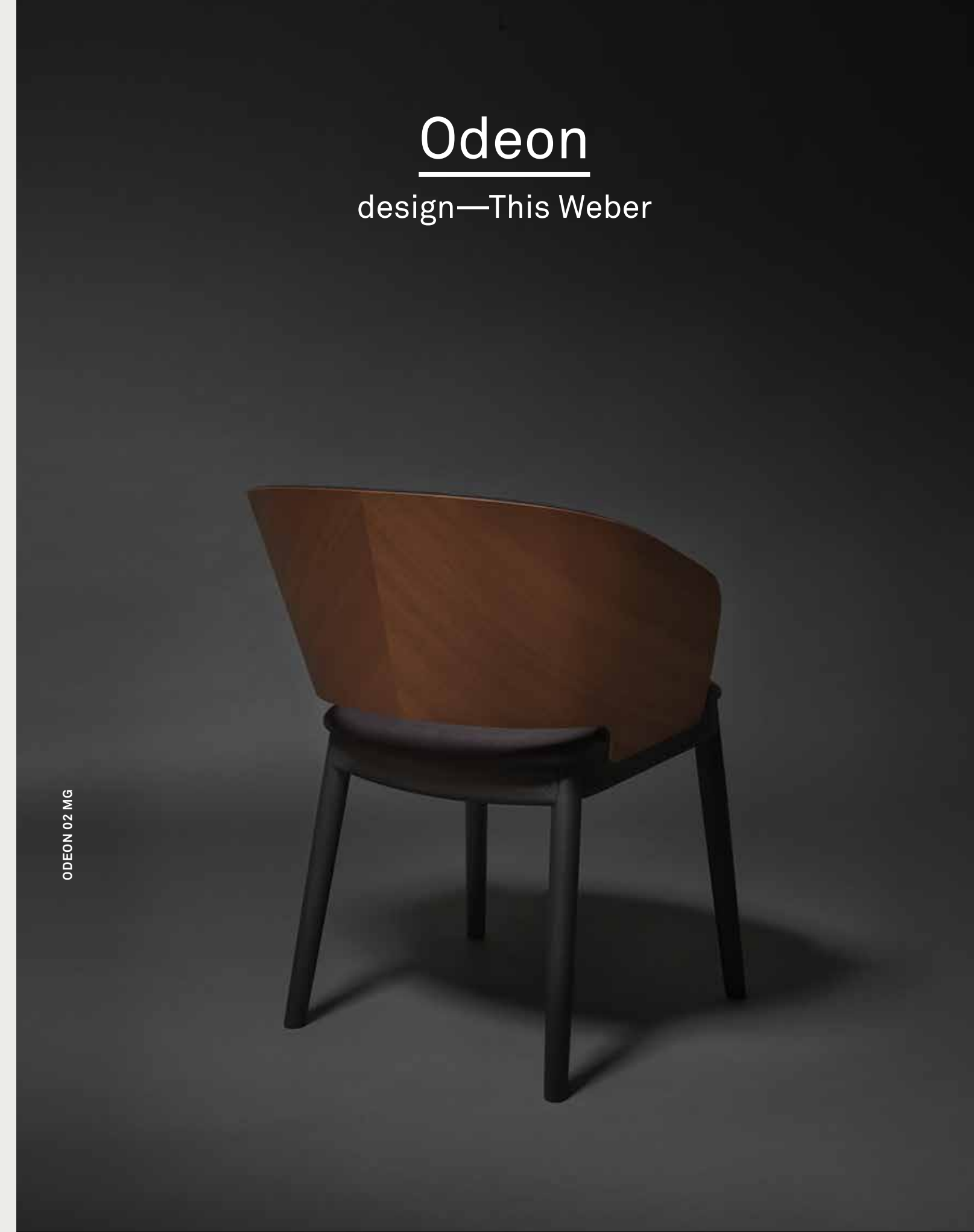
Odeon design—This Weber