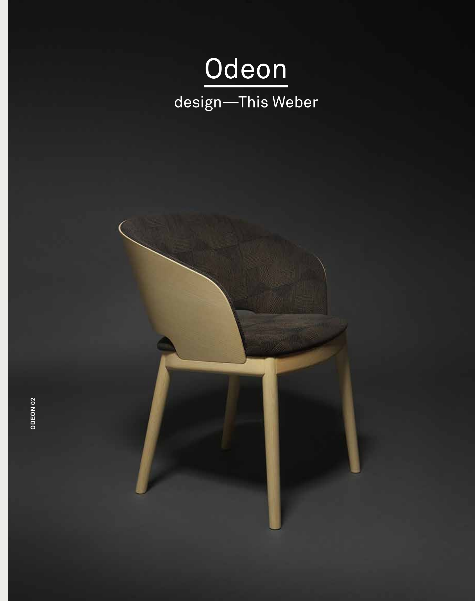
Odeon design—This Weber