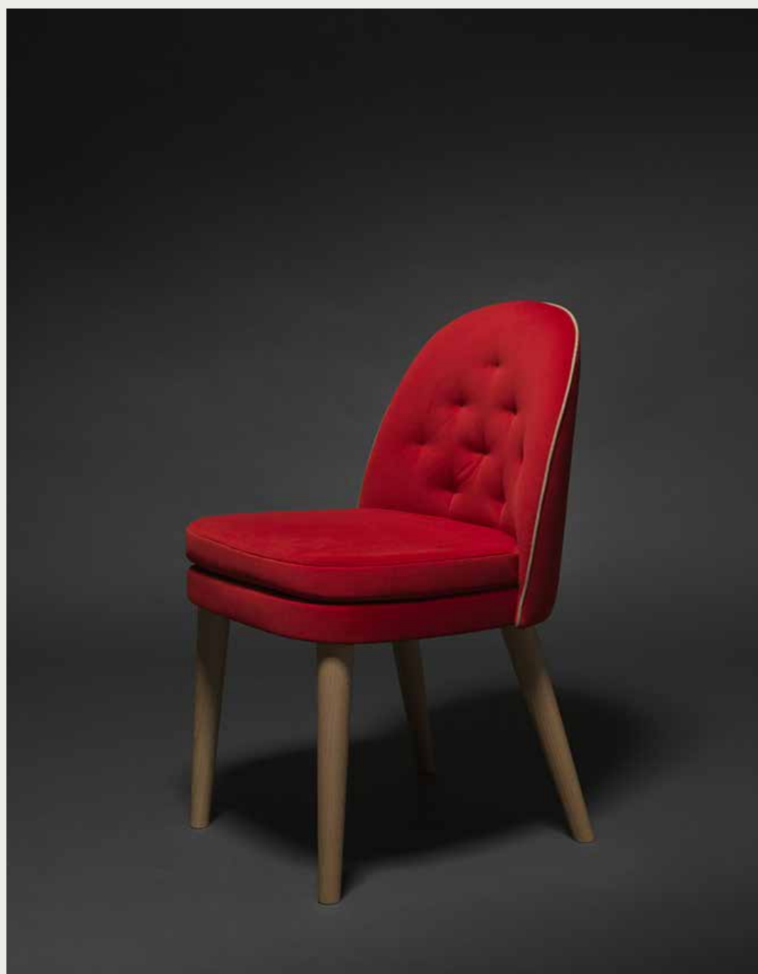
Carmen design—Matteo Thun