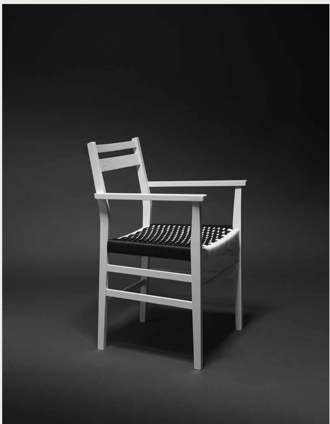
Lisboa design—Matteo Thun