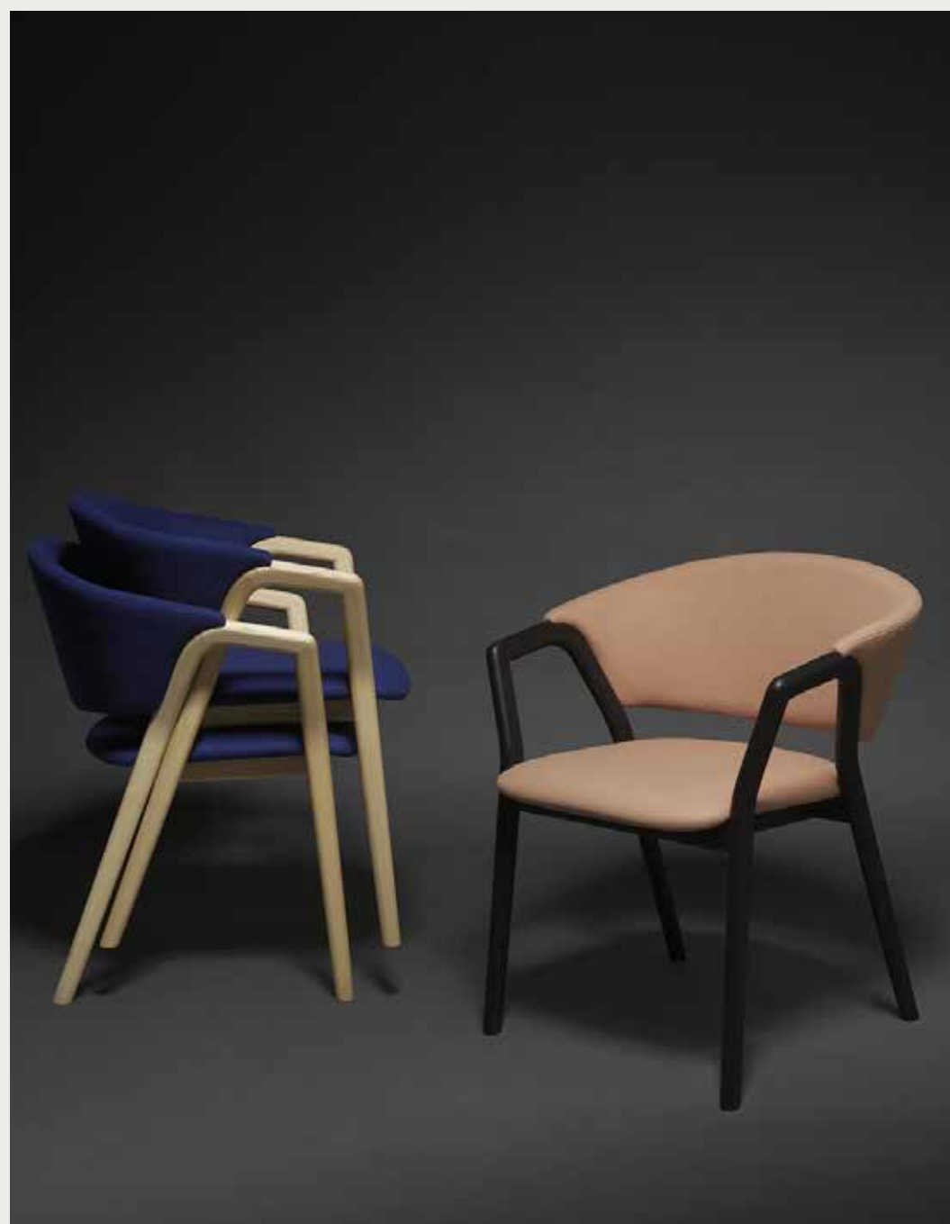
Camden design—This Weber