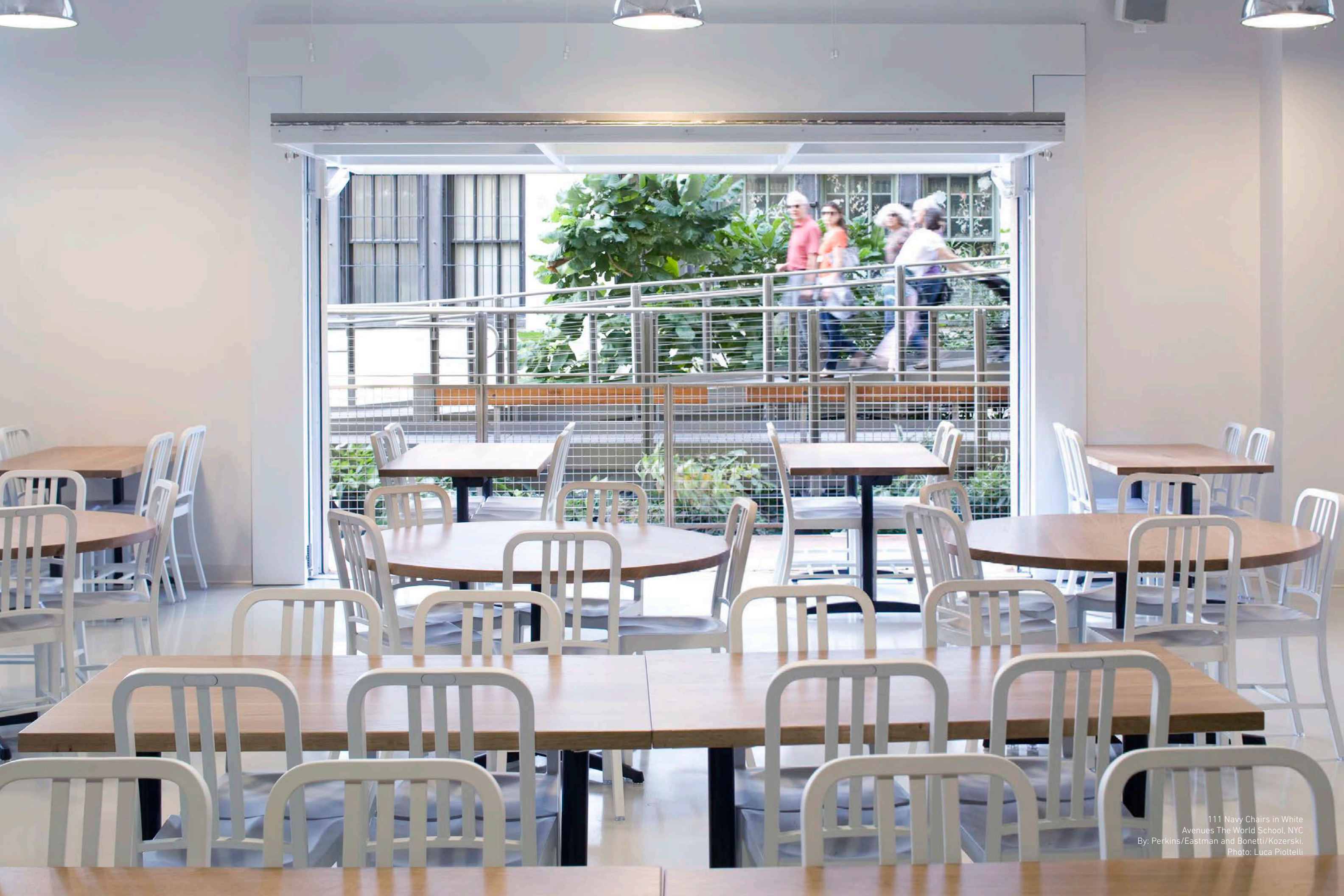
111 Navy Chairs in White Avenues The World School, NYC By: Perkins/Eastman and Bonetti/Kozerski.