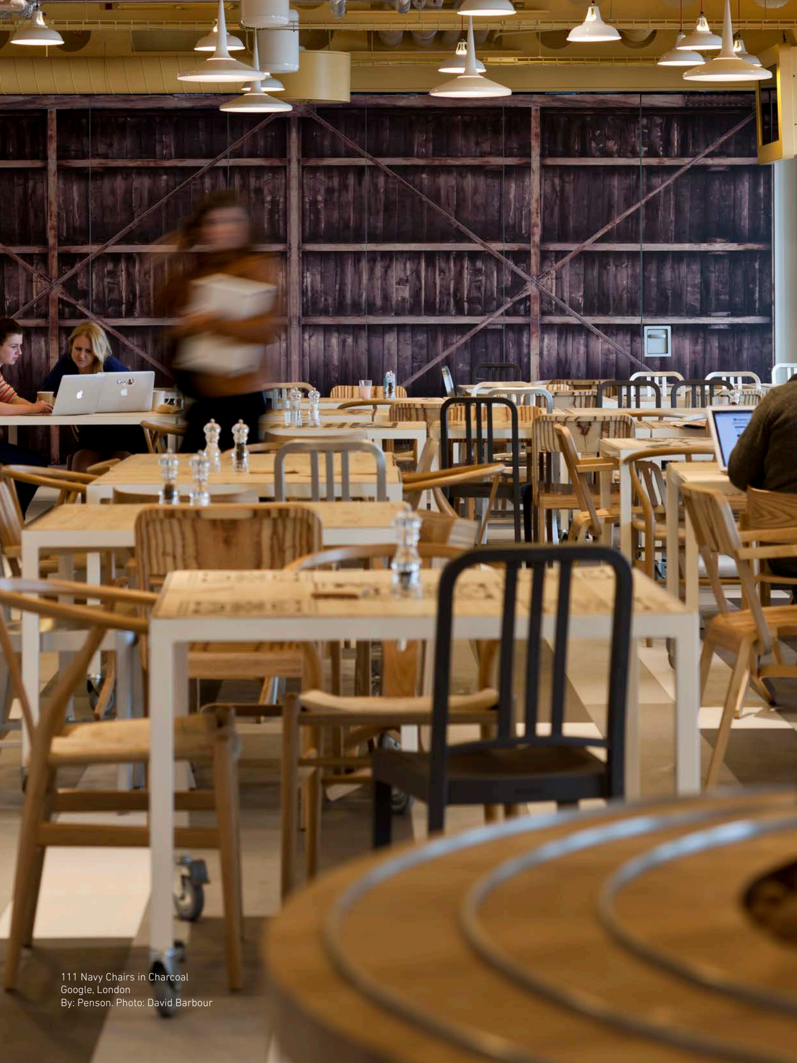
111 Navy Chairs in Charcoal Google, London By: Penson.