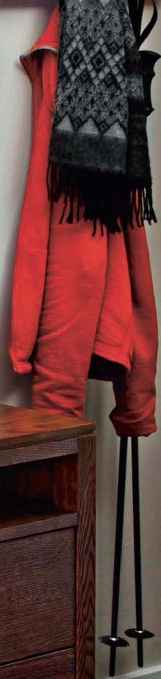
111 Navy Chair in Persimmon Basecamp Hotel, South Lake Tahoe, USA By: Elaine Cotter.