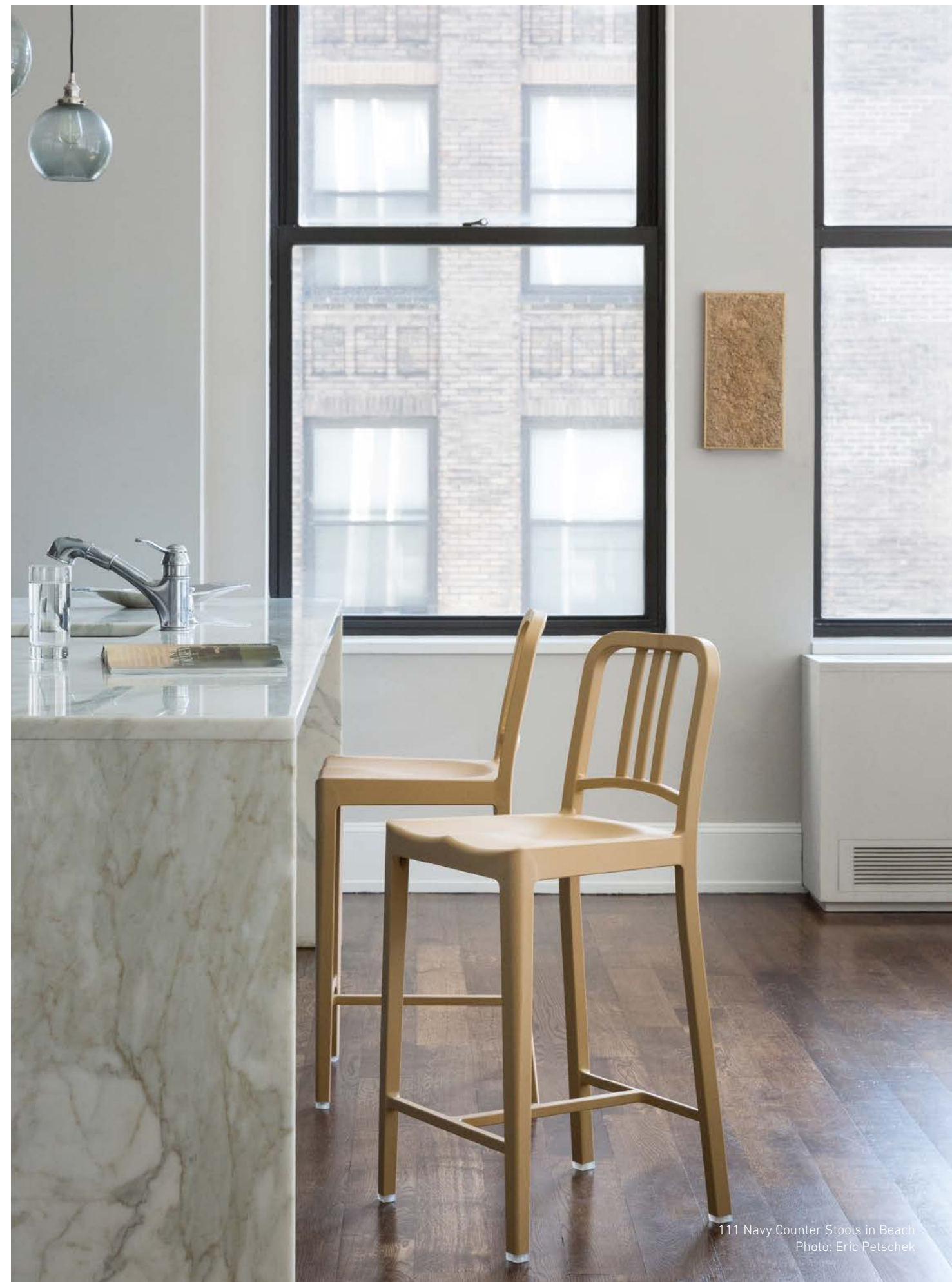
111 Navy Counter Stools in Beach